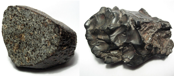
Figure 3: Two different types of meteorites. On the left, a primitive, stony chondritic meteorite, thought to have formed very early in the Solar System. On the right, an iron meteorites, which formed in the core of a large asteroid. An impact later broke the asteroid apart, and sent this meteorite on a collision course with Earth. Both meteorites are around 4 inches wide.

Meteorites are rocks that fall to Earth from space; they have a variety of origins. Most come from asteroids, while some originated on the Moon or Mars. From their chemistry, we can infer the conditions under which they formed and group them with other meteorites with similar characteristics—which are likely to have come from the same parent body (i.e. asteroid).