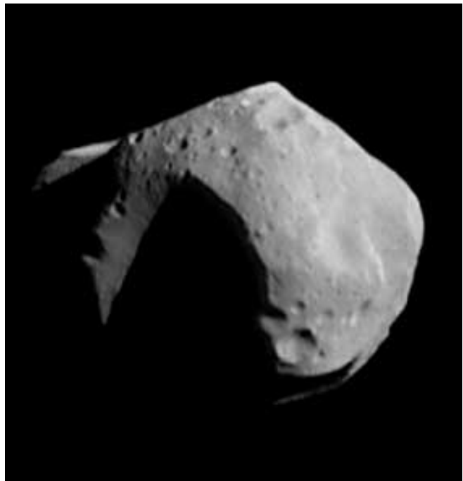
Figure 1: An example of an asteroid. This image of Mathilde is courtesy of NASA. Impact craters are visible on the surface.

Asteroids are bodies that formed in the early Solar System, and are likely to represent planetesimals that survived the period of planet building and are still in orbit around the Sun today. Most asteroids are found in orbits between Mars and Jupiter (although some are on Earth-crossing orbits, and some follow similar orbits to Jupiter—the Trojans). Asteroids are smaller than planets, and typically range from meters up to a few hundred kilometers in size. The first known asteroid, Ceres, was discovered in 1801. Three more discoveries followed in the next six years. By 1900, a few hundred asteroids were known, and by 1980, we had discovered around 9000 asteroids. Then, with the introduction of computerized methods of detection and more sophisticated observational techniques, the number of known asteroids exploded. We now know of more than half a million asteroids, and that number is still growing by thousands of new asteroids every month.